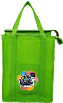
Shown with optional full-colour imprint.

Set-up charge: $60. Price includes: One-colour imprint, one location. PhotoImage® full-colour imprint: Add $1.10 running charge, plus $60 set-up charge. Material: 80 gsm non-woven polypropylene. Weight: 42 lbs. per 100 pieces. Packaging: Bulk. Production time: 10 working days. Offer available in Canada only.