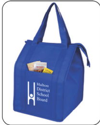
Shown Fully Zipped Up